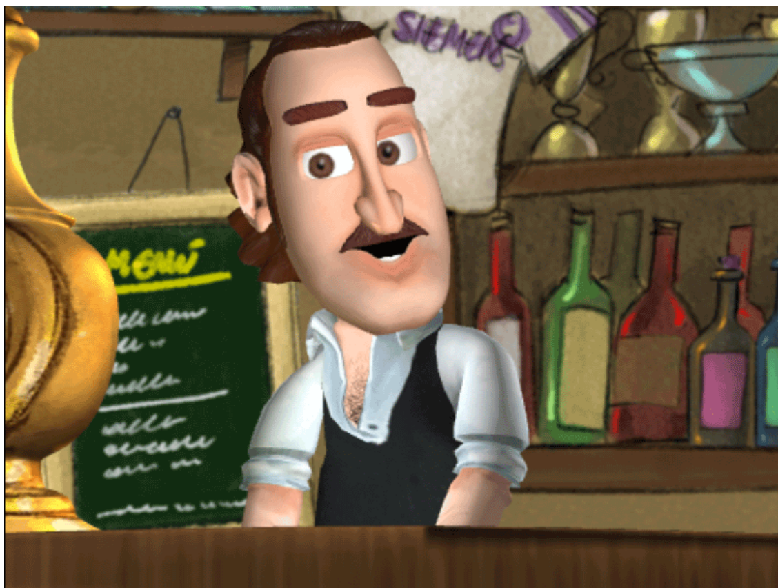
Figure 3: Screenshot of “El Bar de Manolo”